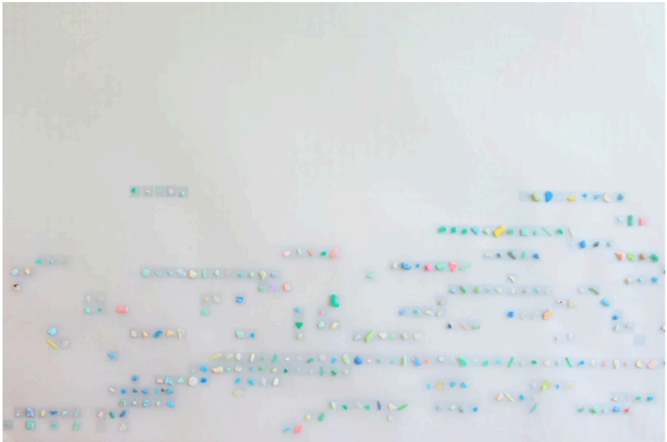
Pratchaya Charemsook, Wave , 2023, Salvaged microplastic on stencil paper, 13 x 16 1/2 x 1 in; 33.5 x 42 x 3 cm

At ETHDenver 2024, ROUNDCOLLAB will feature artworks from five accomplished artists from Thailand, India and Indonesia.