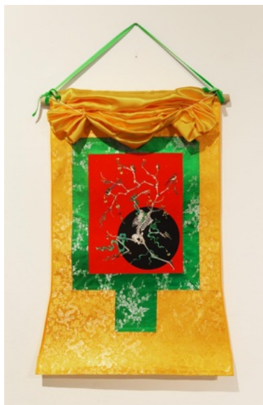
Mathus Kaewdam, Dancer no. 1 , Digital collage print on Tibetan thangka scroll, beading and hand embroidery, 29 1/2 x 49 in; 75 x 125 cm

Mathus Kaewdam (Thailand) turns to mythology, existentialism and archived images as reference material for his digital collages. He contemplates the relationship between humanity and divinity, and explores broader ideas of existentialism. In Dancer no. 1 , his digital collage of made of skeletal figures, fauna and flora depicting a seemingly choreographed movement is mounted on a traditional Tibetan-style embroidered scroll.