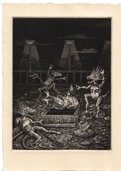
Takdanai Kungsavarangkul, RETTULF , 2021, Etching on copper plate and Aquatint on Fabriano paper, 7 x 10 in; 17.5 x 25 cm

Mathus Kaewdam (Thailand) turns to mythology, existentialism and archived images as reference material for his digital collages. He contemplates the relationship between humanity and divinity, and explores broader ideas of existentialism. In Dancer no. 1 , his digital collage of made of skeletal figures, fauna and flora depicting a seemingly choreographed movement is mounted on a traditional Tibetan-style embroidered scroll.