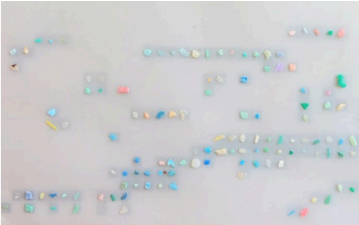
Close-up of Wave , 2023 by Pratchaya Charernsook, made of salvaged microplastic on stencil paper. 13 x 16 1/2 x 1 in; 33.5 x 42 x 3 cm

DENVER, CO, February 23, 2024 – San Francisco gallery ROUND COLLAB with the support of Lionscraft, a German-Singaporean Web3 strategy firm is elated to announce its participation at ETHDenver, the longest-running Ethereum-based blockchain technology event.